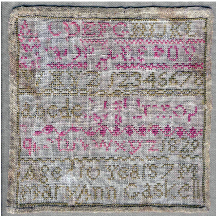
Sampler in present condition after washing and float mounting.