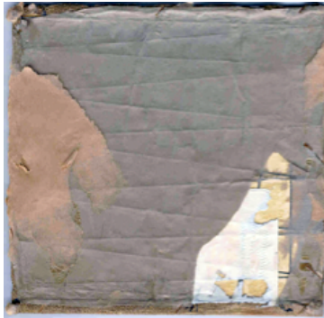
Gaskell Sampler in original condition showing lacing and gluing of paper on the back.

linen was laced onto acid free mat board. There was very little loss of stitching due to washing. Although the sampler is stained and the stitching has deteriorated considerably, it will now remain intact as it is for many years to come.